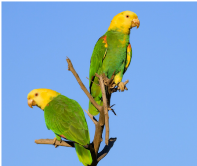
Tres Marias Amazon

Tour Style [A – Easy Birding w/comfortable accommodations & pace] Price/Itinerary available upon request