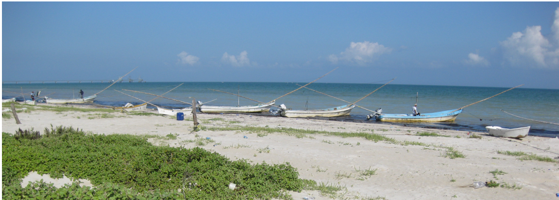
Fishing 'pangas' on the north coast of Yucatan State

[4] CUSTOM TOURS - Approximately one-in-five of our departures are with small groups, couples, and individuals that have contacted Legacy Tours directly with a list of their target birds, a destination idea, or a special desire. These trips require commitment and planning well in advance to lock-in optimum dates.