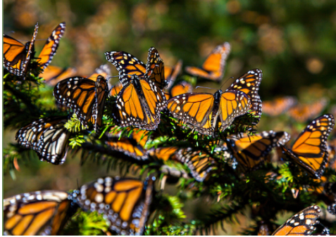
Monarchs (close up)

Price/Itinerary available 12-months before departure