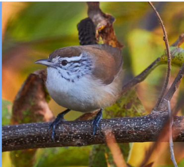
Tres Marias Wren