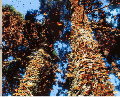
Monarchs (filling the forest)