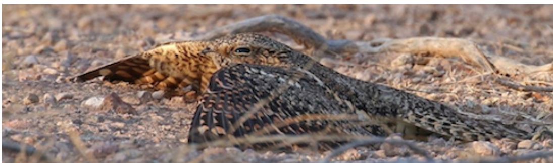
Female LESSER NIGHTHAWK on a barren ground nest in the Sonora Desert

[3] HERITAGE-STYLE BIRDING TOURS [A] - are conducted in those countries where there are just enough birds of interest (island endemics, limited range species, etc.) while the nation itself has a unique and inviting personality. We consider Portugal (and its two Atlantic Islands), the Mediterranean islands of Corsica & Sardinia (two endemics), Scotland & Ireland, and the wintering crush of Monarch Butterflies in Mexico as examples of Heritage-Style destinations. Though a valuable aspect of these tours, birding shares the spotlight within daily programs that also incorporate activities of a cultural and/or historical nature.