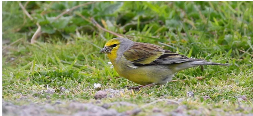
CORSICA FINCH – Endemic to Corsica & Sardinia