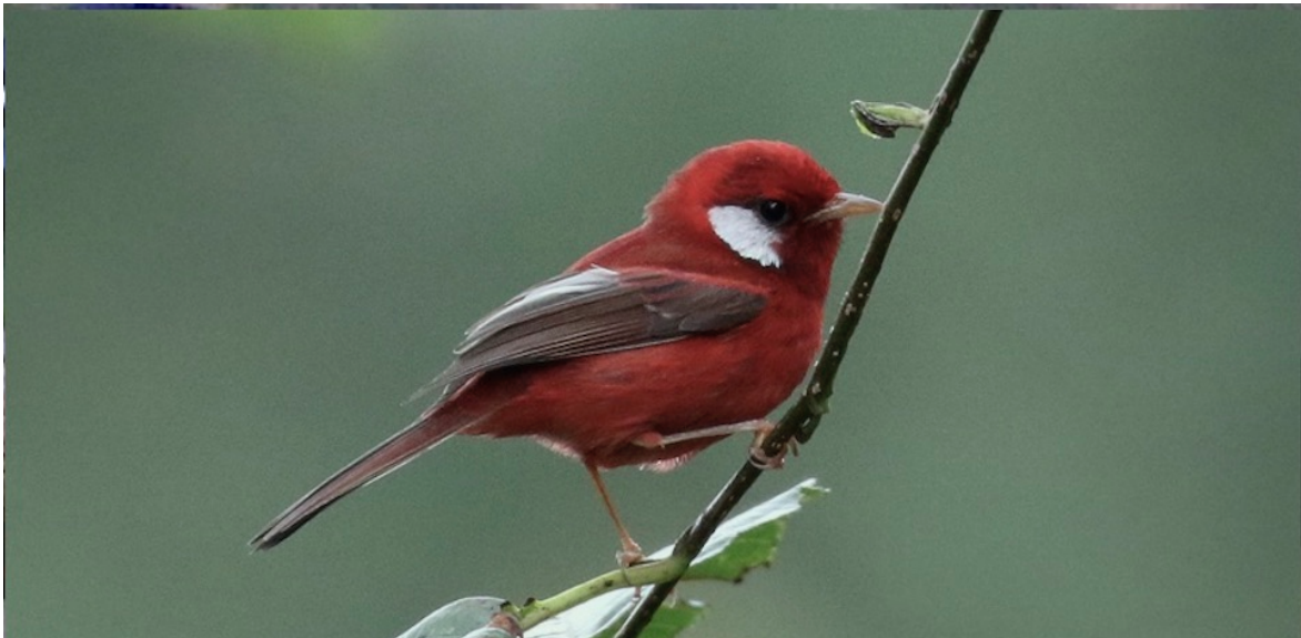
RED WARBLER (Race 'rowleyi' is a Mexican Endemic found in Oaxaca State)

https://legacy-tours.com/mexico-birding-tours/