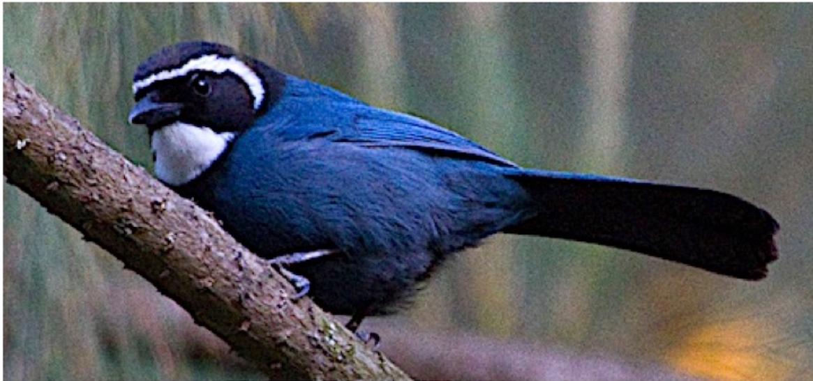
WHITE-THROATED JAY ( Sierra Madre del Sur de Guerrero )