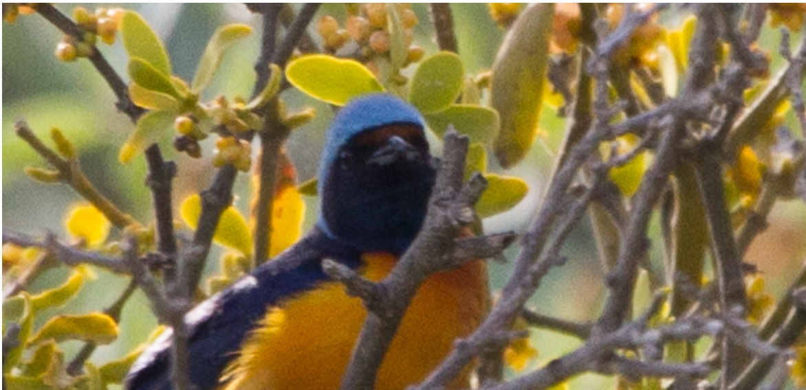
ELEGANT EUPHONIA – Found in the mountains of western and southern Mexico

https://legacy-tours.com/mexico-birding-tours/