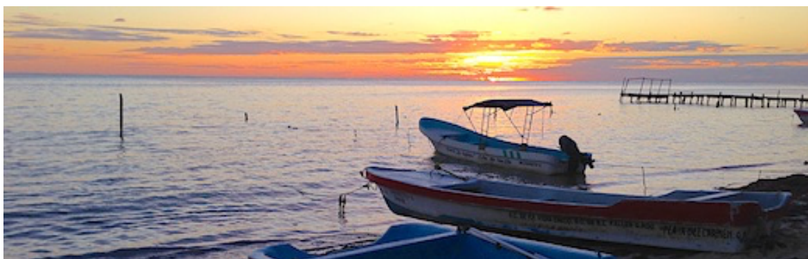
Everyone loves the Yucatan Peninsula – birders and vacationers alike!